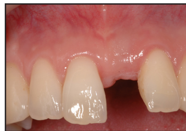
4a. Healed site after failed implant was removed and site was reconstructed (Refer to Figs. 5 and 6 from Fall 2014 Newsletter).

Since the buccal bone fully resorbed, the implant was removed and the site was reconstructed (4a). After healing, another implant was subsequently placed. The final result is shown (4b).