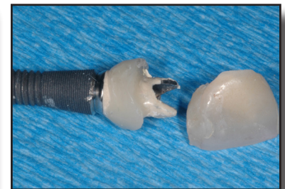
3. Immediate implant with immediate temporization destabilized shortly after surgery when the patient bit into an apple.

Although this patient was fully informed and signed a waiver regarding the limits of functionality of the temporary, he bit into an apple shortly after surgery (3).