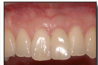
4b. Replacement implant and final restoration.

In this instance, the risk of placing an immediate far exceeded the reward due to the complications that arose.