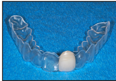
1b. Essix for temporization of 1a.

It is critical that post-surgical treatment planning for temporization of an immediate implant be discussed with the patient prior to surgery. Patient occlusion, parafunction and compliance are also significant risk factors that must be thoroughly investigated and addressed prior to commencing treatment.