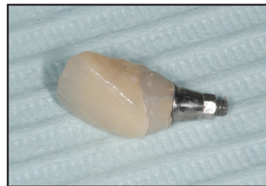
2. Temporary custom abutment and crown (lab fabricated).

Temporary abutments and temporary crowns are the preferred method of temporization for immediate implants as they contribute to successful aesthetics in the short and long term (2). The risk factors are high and often relate directly to the patient. Does the patient fully understand the functional limitations of a temporary crown and abutment? Fracture of the temporary crown will be a nuisance but catastrophic failure of the implant is a much greater concern. (Refer to the Summer 2014 Newsletter for a guideline to replicating natural teeth with cement-retained temporaries).